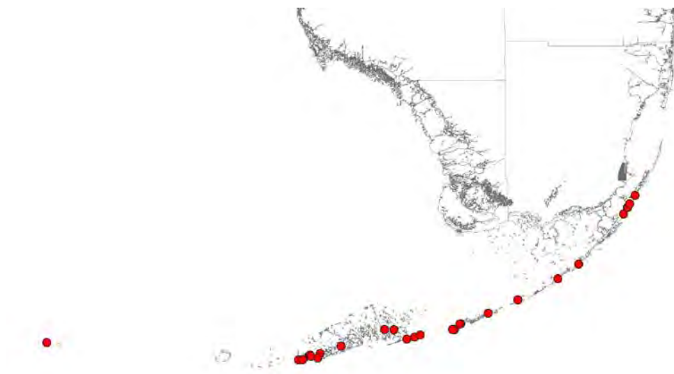
Fig. 1. Locality records from museums and FNAI for the Florida Keys mole skink (many specimens from the Upper Keys show intergradation with the peninsula mole skink).

skinks probably occur on many other keys (Duellman and Schwartz 1958), particularly ones with undeveloped shorelines.