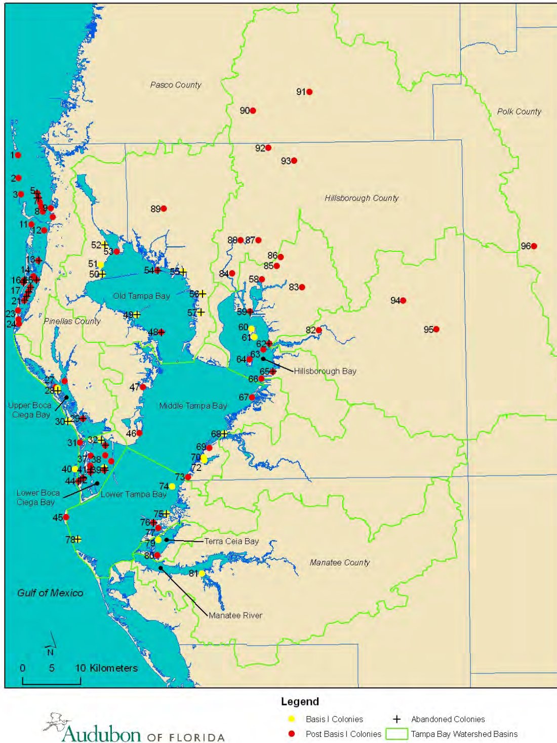
Figure 1. Bird colonies in the Tampa Bay, Florida, USA, ecosystem from 1984-2009 (colonies 1-24 are excluded because they are not in the Tampa Bay watershed).