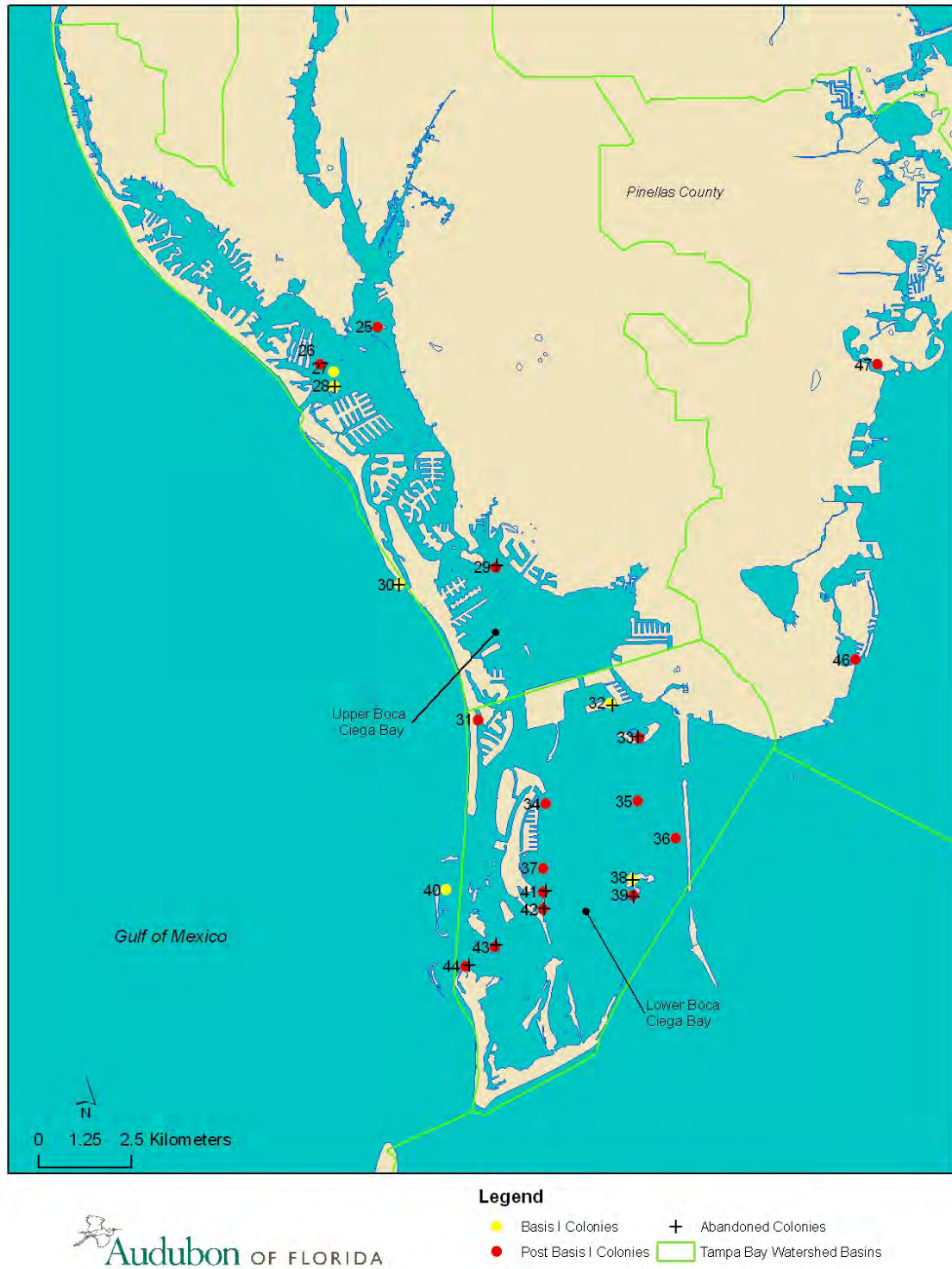
Figure 2. Bird colonies in Boca Ciega Bay, Florida, USA, from 1984-2009.