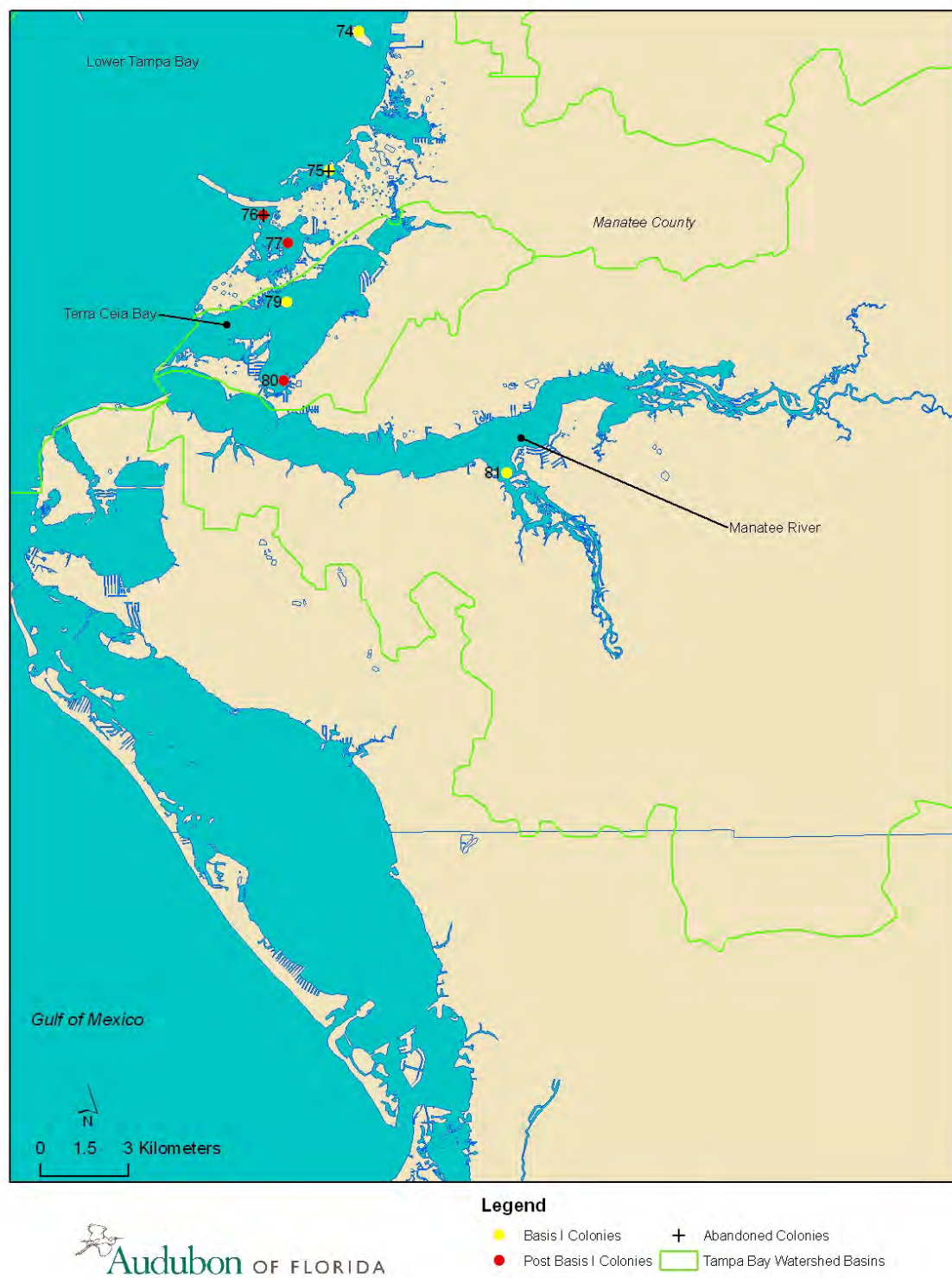
Figure 3. Bird colonies in Terra Ceia Bay, Florida, USA, from 1984-2009.